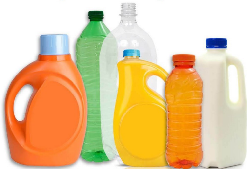
Plastic bottles marked #1 and #2 including milk jugs, fruit juice bottle/jugs, detergent jugs and soda/pop bottles.

NO PLASTIC BAGS/FILM, STYROFOAM OR SYRINGES